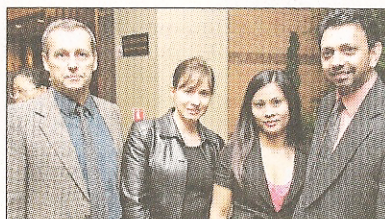
Showing their support in the fight against this disease